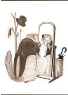
B Happy Groundhog Day! Celebrate in style.