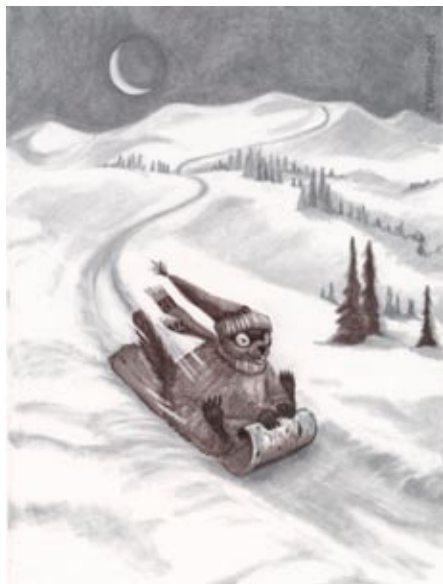
M Slide happily into the holiday for the best Groundhog's Day ever!