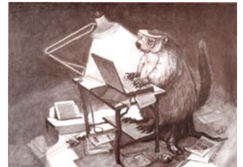
L Winter... halfway gone Hope it is a creative one! Happy Groundhog Day!