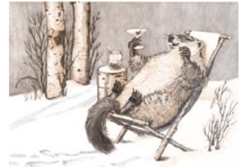
K A toast to the season! Happy Groundhog Day!