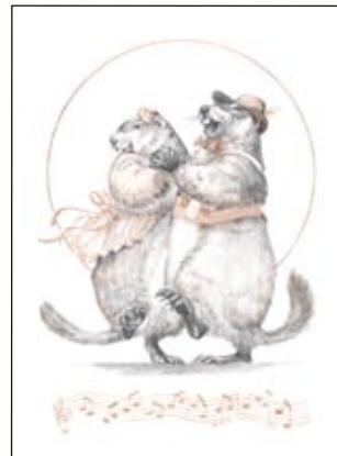
I Spring's coming... Let's celebrate! Happy Groundhog Day! February 2nd (This card is a little bit smaller than the others: 4-1/2" x 6-1/4".)