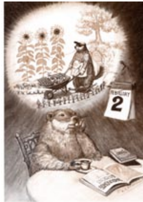
G It's Groundhog Day— Time to think Spring!