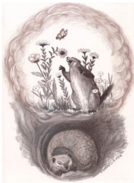
N Happy Groundhog Day! May those delicious dreams of springtime soon come true.