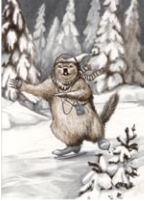
A Happy Groundhog Day! Beyond a shadow of a doubt...