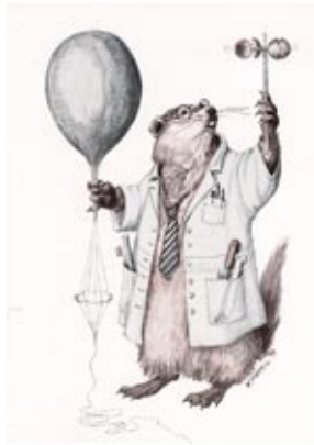
D Weather or not— a Happy Groundhog Day is the forecast for February 2! Wishing you the finest of holiday!