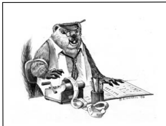
O Happy Groundhog Day! May the year ahead ADD UP to the BEST EVER.