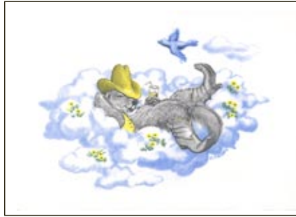
F The coming Springtime will be as wonderful as (Ground) Hog Heaven! Happy Groundhog Day! February 2nd (This is the only card made thus far with 3 colors.)