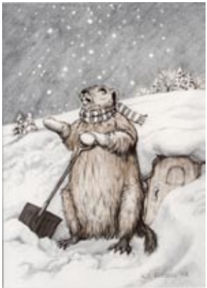
C Beyond a shadow of a doubt, It's back to bed...or shovel out. Happy Groundhog Day!