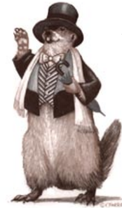
J This design is a blank notecard. Write your own greeting or have one custom imprinted.