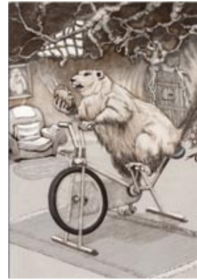
H Happy Groundhog Day! May you pedal smoothly into the year ahead.