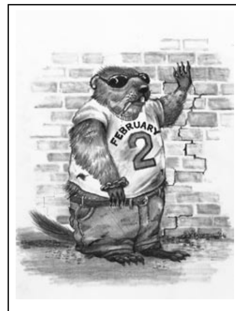
R Happy Groundhog Day DUDE!