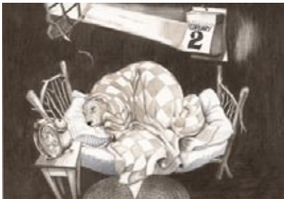
E Whoops! I missed the holiday... But Happy Groundhog Celebration anyway!