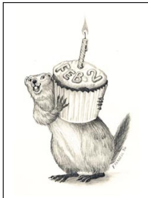
P Happy Birthday, Cupeake!